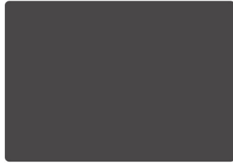
R13/SGR13/PT13 Deep Charcoal