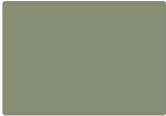
R28/SGR28/PT28 Slate Gray