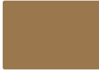
R25/SGR25/PT25 Colina Tan